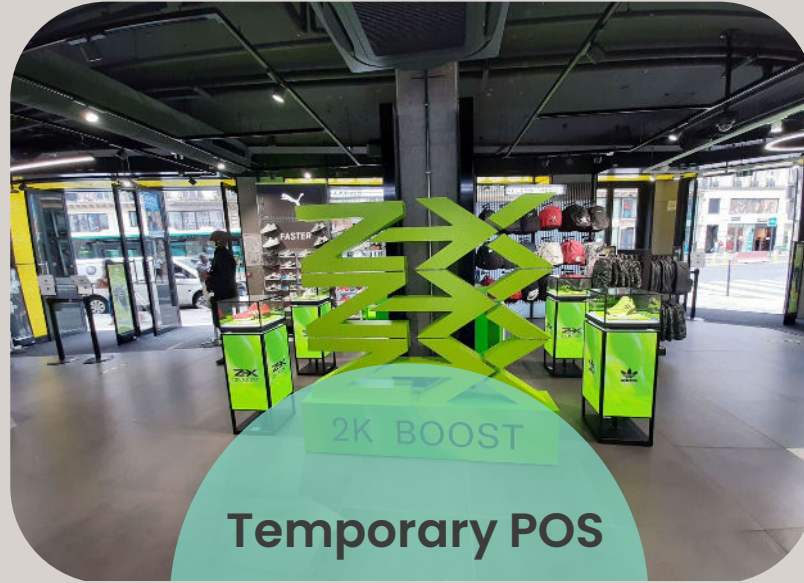
2K BOOST Temporary POS