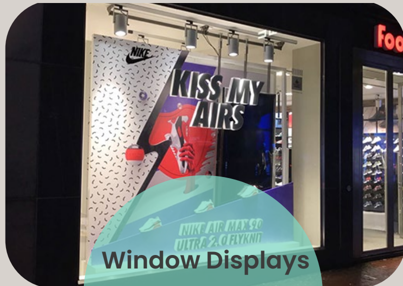
NIKE AIR MAX 90 ULTRA 2.0 FLYKNIT Window Displays