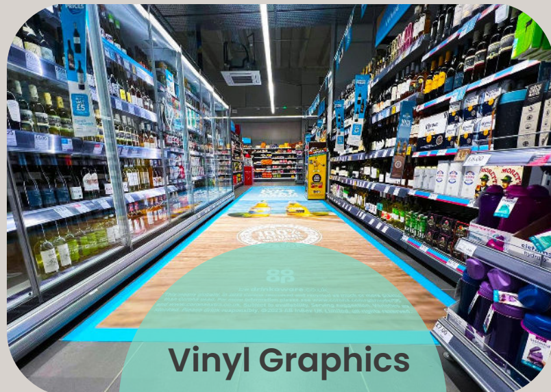
88 Vinyl Graphics